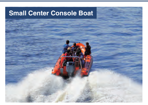
Stow the RF unit out of site and have only the CommandMic<sup>™</sup> on the console panel.

The waterproof CommandMic<sup>™</sup> can be used in open top areas even in rain or splash conditions.